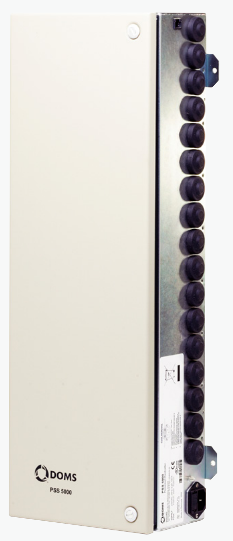
High Performance & Flexible This base system has the powerful CPU board, which provides a fast, stable platform that can statisfy the demands of large, multi-device forecourts.