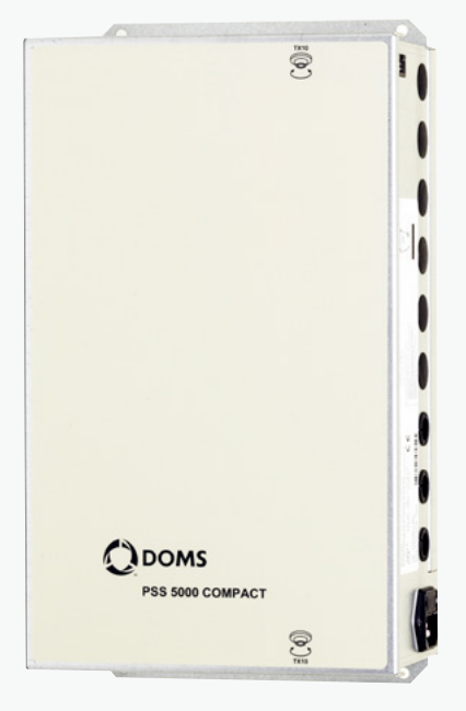
Entry Level & Low Cost For small, static forecourts with only a few devices and no plans for expansion. This version provides the same basic functionality as the other options and a enough space for a reduced number of hardware interface modules.