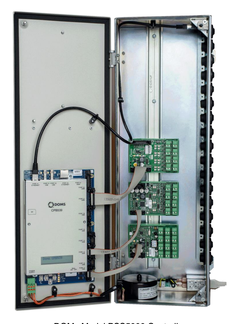
DOMs Model PSS5000 Controller